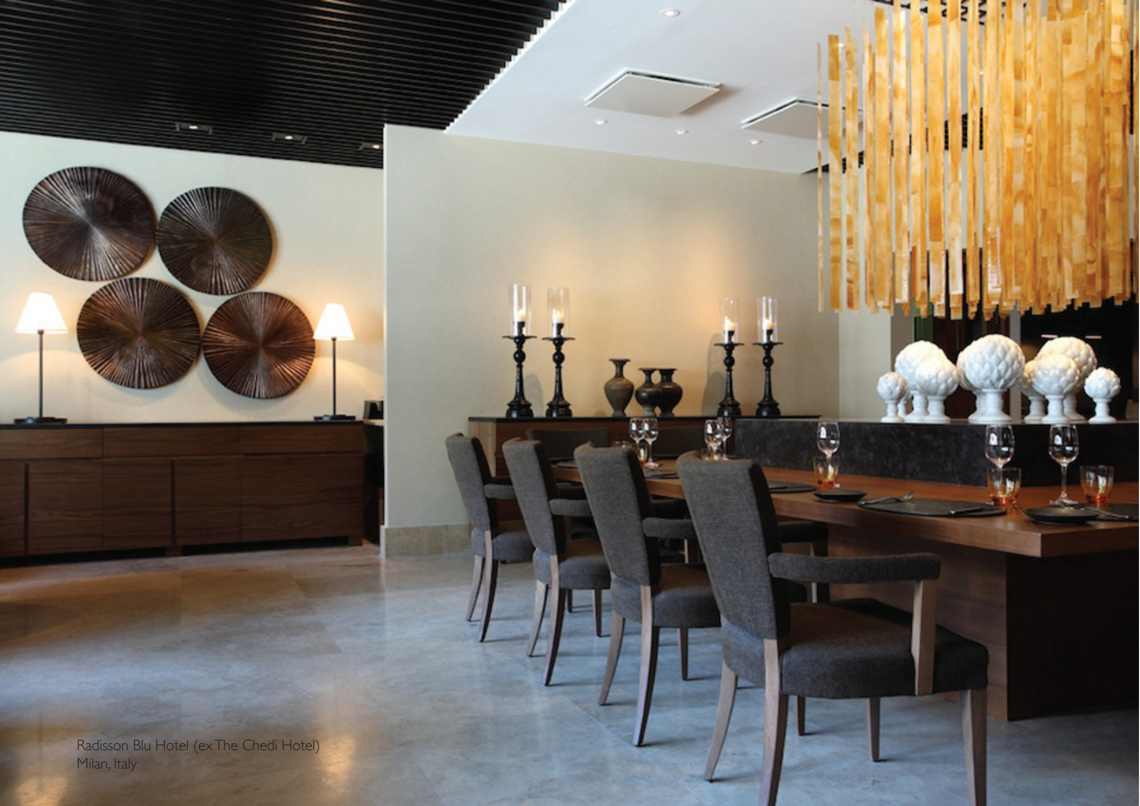
Radisson Blu Hotel (ex The Chedi Hotel) Milan, Italy